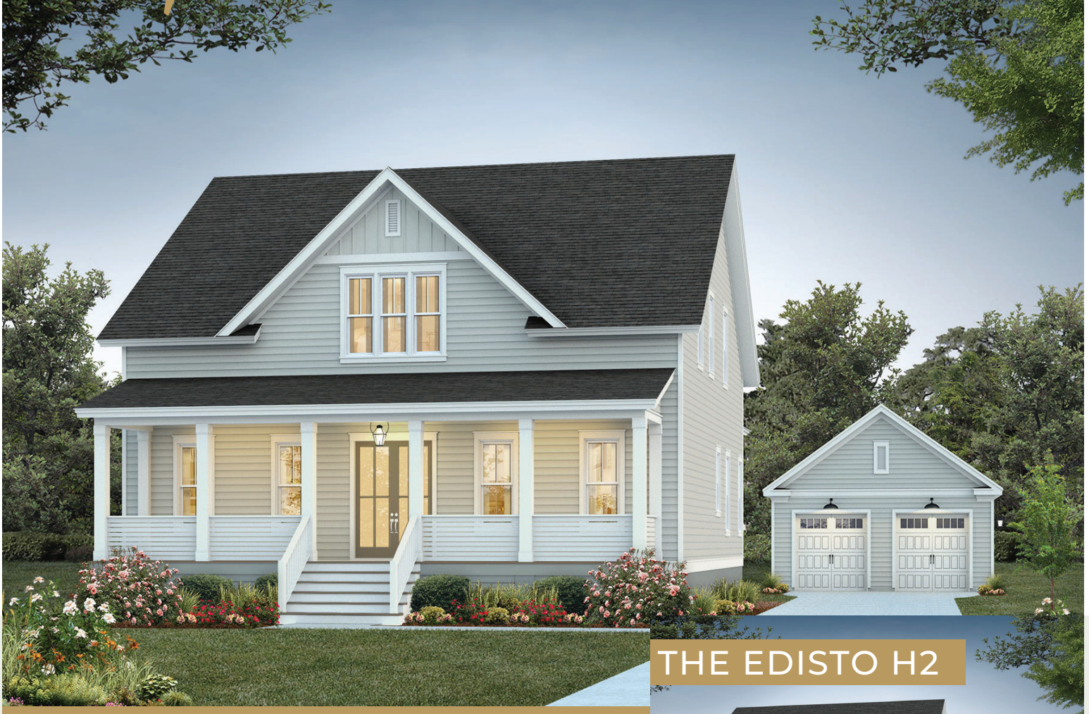
THE EDISTO H2