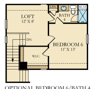
OPTIONAL BEDROOM 6/BATH 4