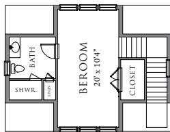
OPTIONAL FINISHED ROOM ABOVE GARAGE- 372 SQ.FT.